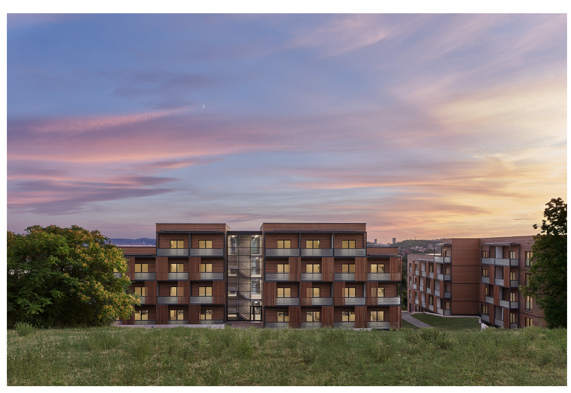
PlusEnergy Quarter P18